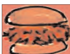
Bar-b-Que Chopped Beef